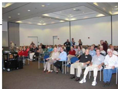
IBM History Attendees