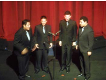
Coastmen Chorus Quartet