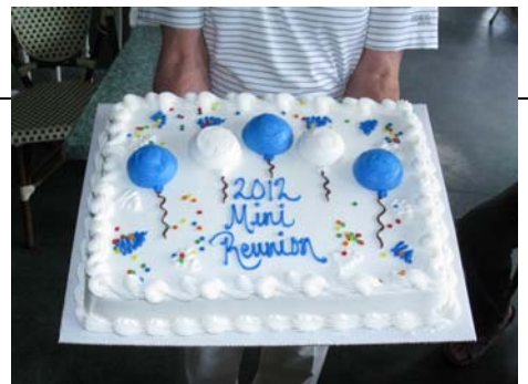
S/7-S/1 Lunch - Reunion Cake