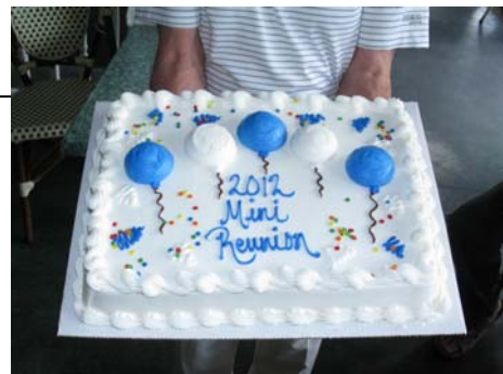
S/7-S/1 Lunch - Reunion Cake