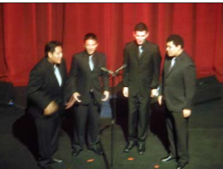
Coastmen Chorus Quartet