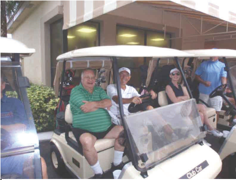
Delray Golf - We're Ready