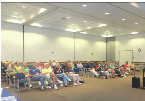
SmartPhone Meeting Attendees