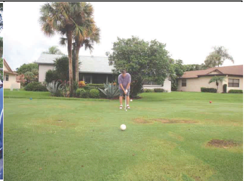
Delray Golf - Tee Time