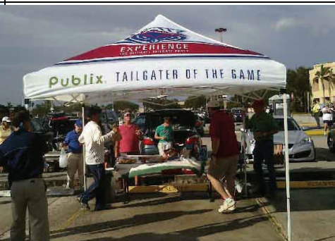
Tailgate Party - Under the Tent