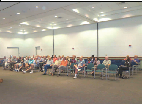
IBM Boca Raton History III - Attendees