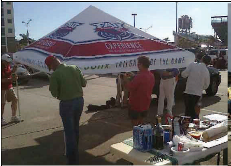
Tailgate Party - Assembling the Tent