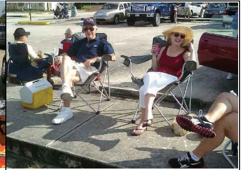
Tailgate Party - Some Serious Planning