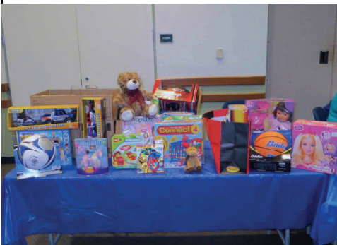
Annual Meeting - Toys for Tots