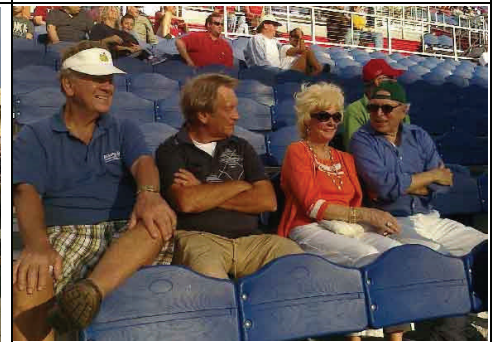
FAU-Troy Game - Let's get the game started!