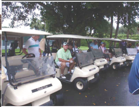
Delray Golf - Let's Get Going