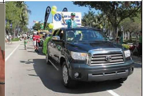
St Patrick's Day Parade - Jud McCarthy and Family