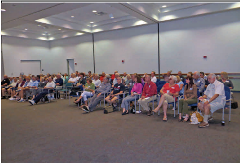
Annual Meeting - Attendees