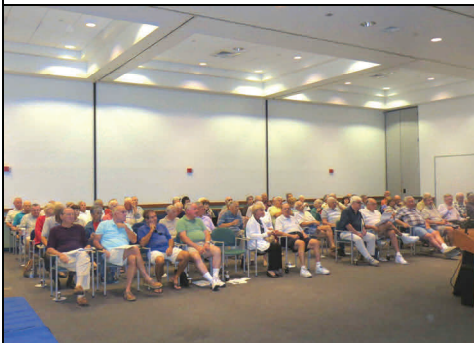
Benefits Meeting Attendees