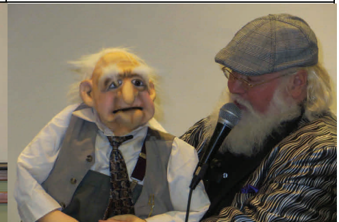
Annual Meeting - The Amazing Mr. "A" The Dummy can Talk!!