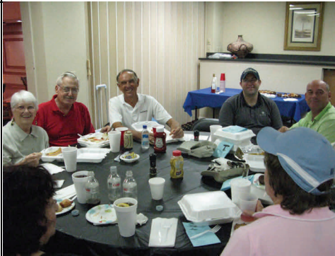
Delray Golf Lunch