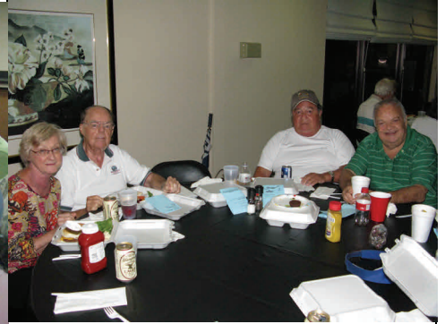
Delray Golf Lunch