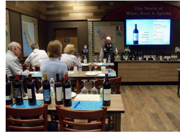
Tasting Room Overview 2