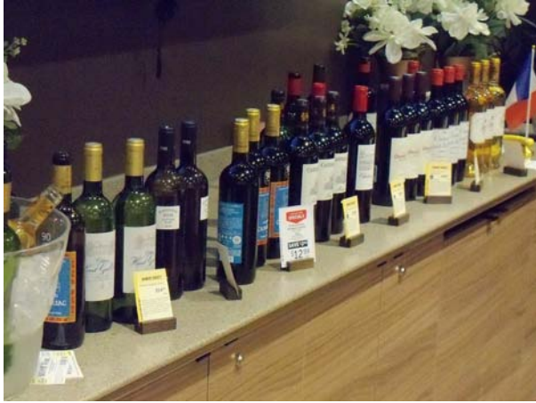
The Eight Wines