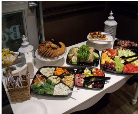
Charcuterie Board and Snacks