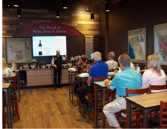
Tasting Room Overview 1