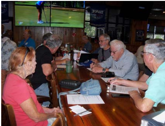
IBMSFQCAA Monthly Directors Meeting