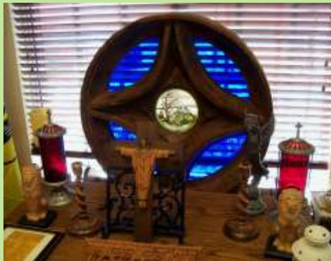
A few of the many artifacts on display at the Martin Luther Center Museum