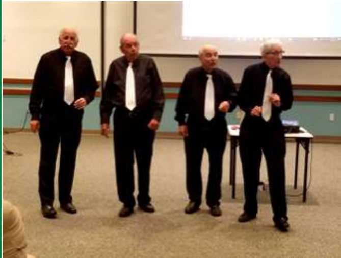
Cameo Quartet Singers

On December 8 the IBMSFQCAA held its Annual Meeting at Sugar Sand Park. There were 53 members attending. The attendees were entertained by the Cameo Quartet singers. Everyone was thoroughly entertained!