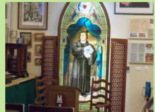
Beautiful Stained Glass Of Martin Luther - just one of thousands of artifacts on display