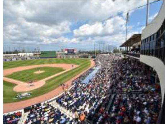
Ballpark of the Palm Beaches - 1st Base Side