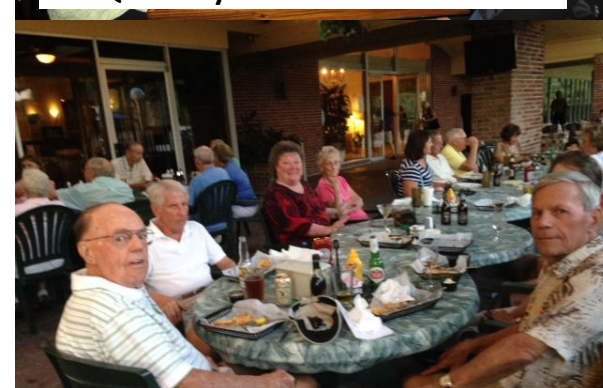
Naples Golf Outing