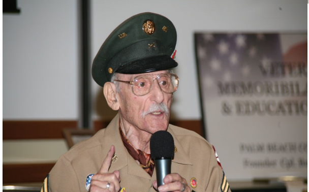
Honoring Our Veterans