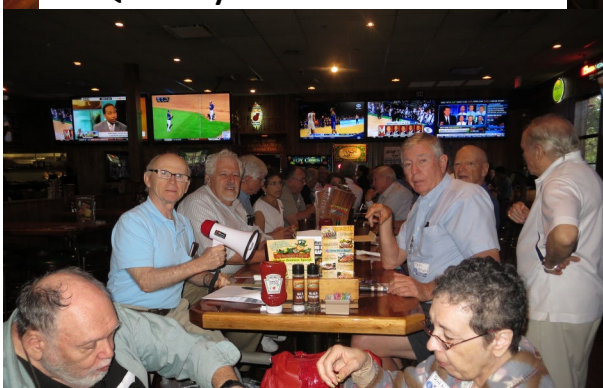
Quarterly Luncheon-Ale House