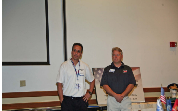
Honoring Our Veterans