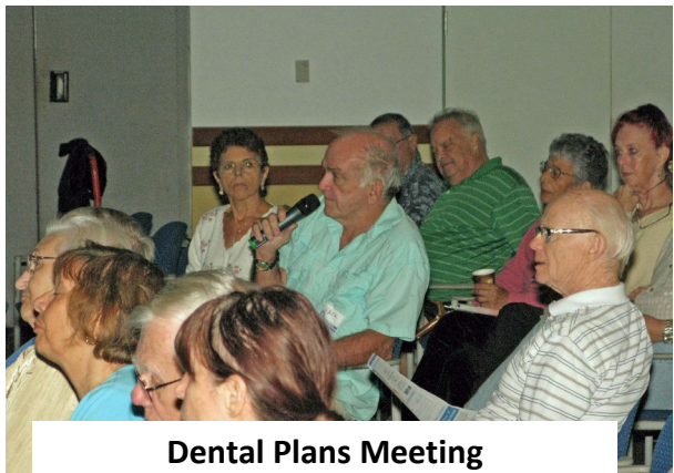
Dental Plans Meeting