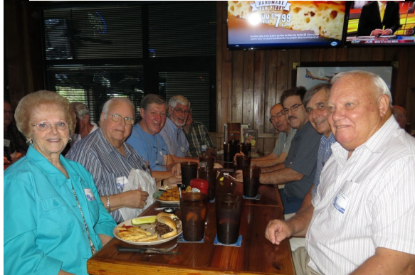
Quarterly Luncheon-Ale House