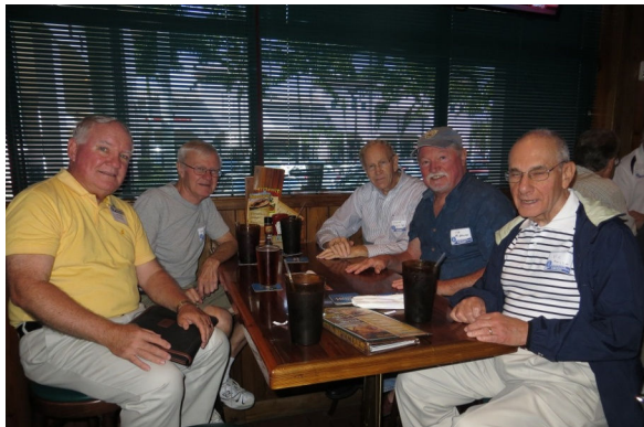
Quarterly Luncheon-Ale House