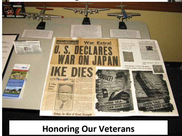
Honoring Our Veterans