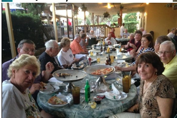
Naples Golf Outing