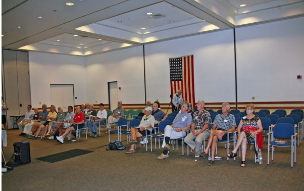
Honoring Our Veterans