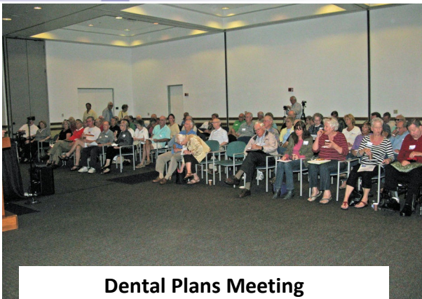
Dental Plans Meeting