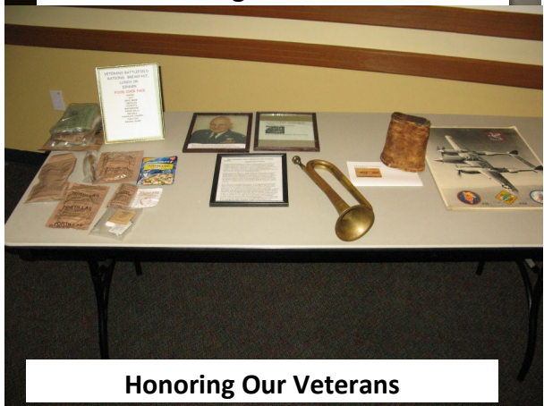
Honoring Our Veterans