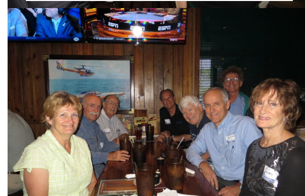
Quarterly Luncheon-Ale House