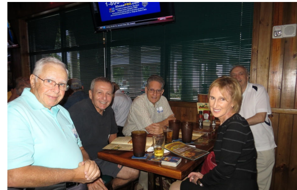
Quarterly Luncheon-Ale House