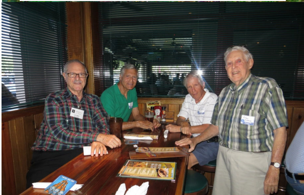
Quarterly Luncheon-Ale House