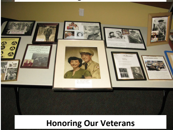
Honoring Our Veterans