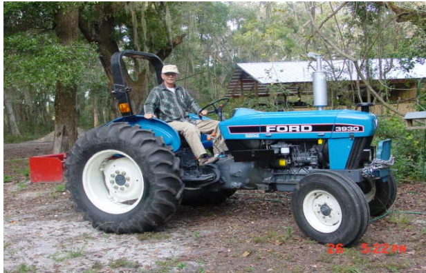
Our tractor from days when we had our farm after retirement