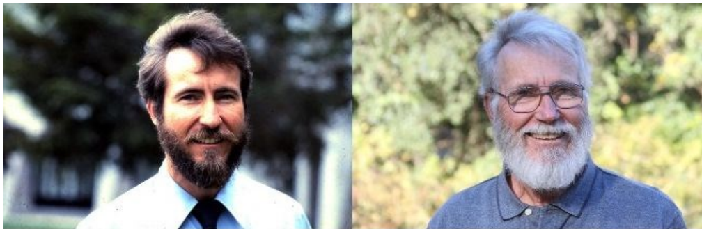
IBM Engineer, 1975